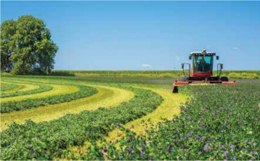
Alfalfa fields that have been managed without the use of GMOs and other substances prohibited by organic regulations may be able to pass through the three-year transition period more quickly.

option to renew for an additional five years. Examples of eligible practices include: