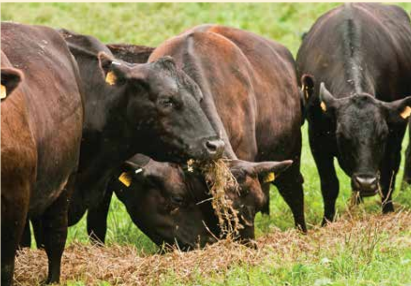
Beef cattle graze on pasture and a silage of grass and alfalfa at an organic farm in Adamstown, Md.

Organic rules require that livestock health and natural behavior be accommodated year round. One application of this rule is that livestock must have daily access to fresh air, sunlight and the outdoors, and that ruminants must have access to pasture. So if you're already providing outdoor access and grazing your ruminant livestock, the transition to organic will be less complicated than if you operate a confinement system. In the 1990s, many beef producers in Nebraska entered the organic market with ease because they were able to adapt existing pasture-based systems they'd perfected over the years, according to the Center for Rural Affairs. In addition, dairy farmers who use pasture as a major feed source and who are balancing milk production output with herd health practices that don't require routine use of antibiotics and hormones also find it easier to transition.