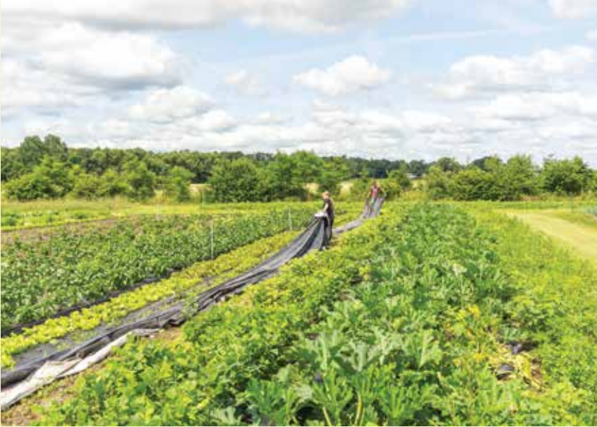
At this organic farm in DeMotte, Ind., tarps are laid out on beds to terminate weeds and cover crops before a new crop is planted.