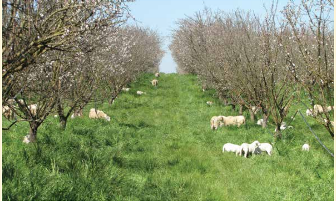
Management often becomes more intensive when you transition to organic. At this organic almond orchard in Denair, Calif., soil health is maintained by integrating cover crops and rotational sheep grazing.