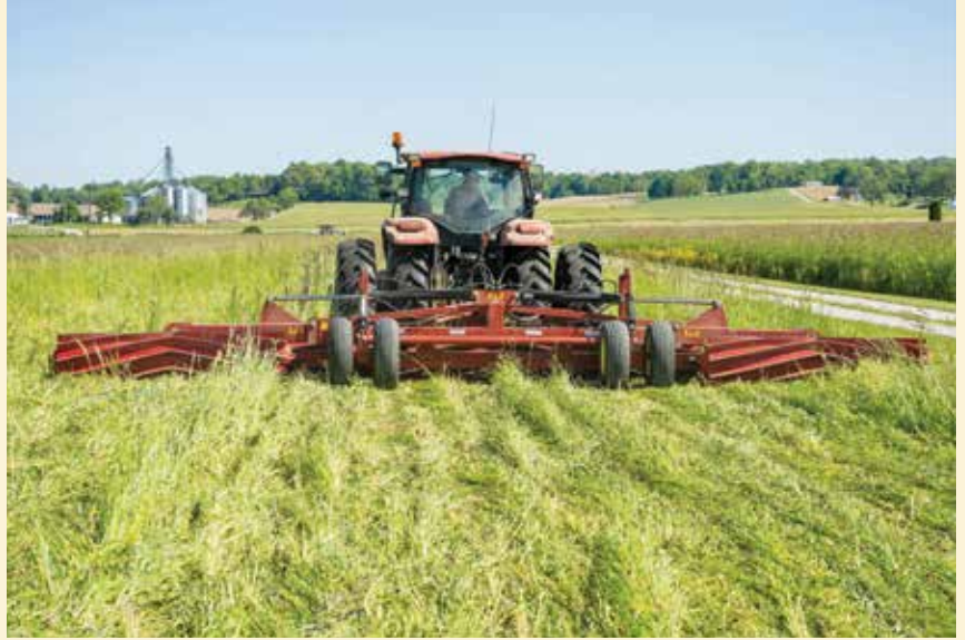
Walk-behind and tractor-mounted roller crimpers can allow you to terminate a cover crop without tillage.

In integrated crop and livestock operations, reducing tillage by rotating with perennial crops and grazing is an excellent way to build soil health.