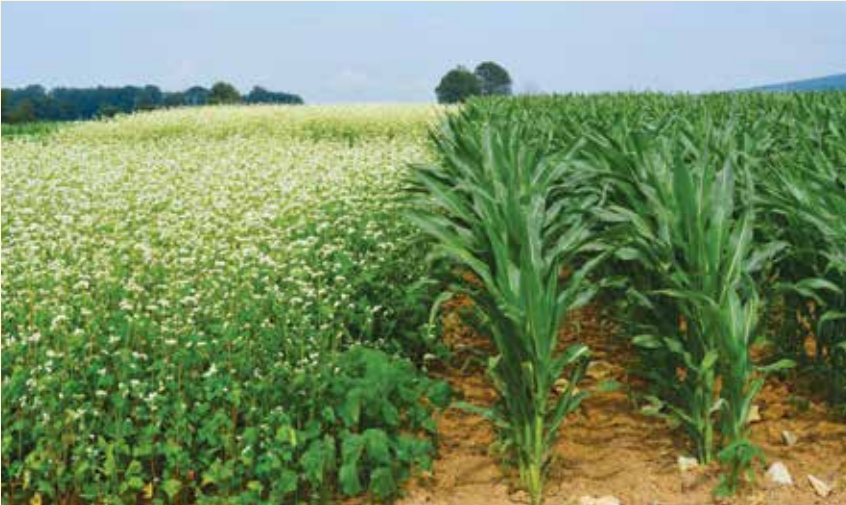
This strip of buckwheat in bloom provides resources for beneficial insects that can improve pest control in the adjacent corn field, which is managed organically in central Pennsylvania.

Organic producers work closely with the environment to maintain the balance of their ecosystem.