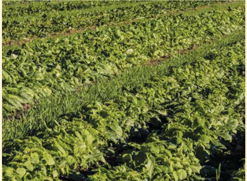
A rye cover crop planted between lettuce rows at an organic farm in Peconic, N.Y.

Although high C:N materials don't provide as much fertility as other sources, carbon does enhance soil structure over time and pools of N can accumulate in soils that are rich in organic matter. Improved soil structure also improves root growth, which can improve a crop's uptake of nutrients and water. Nitrogen also needs to be regularly replenished, since much of it is removed